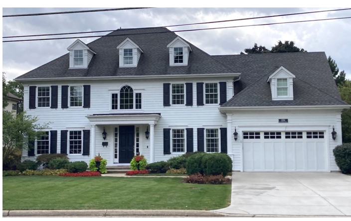
1211 W. Lincoln

Tickets are now on sale for the Mount Prospect Historical Society's 36<sup>th</sup> annual Holiday Housewalk which will highlight the We-Go Park and Bobby Lane neighborhoods north of the Mt. Prospect Country Club. The walk will be held from 3:30 to 9 p.m., Friday, December 6.